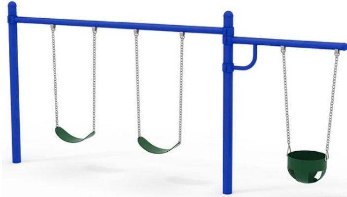
Single Bay Swing, 8' tall, with Cantilever, $5,000 installed